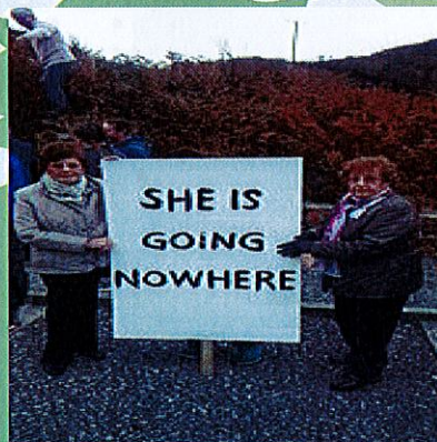
The local community came out in force to protest against the removal of Omeath's 'Long Woman' from her rightful resting place.