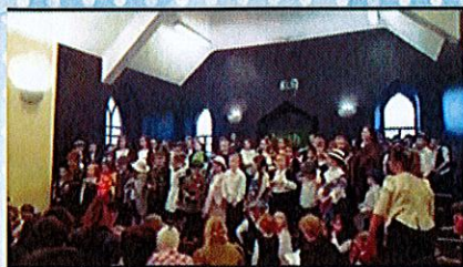
St. Lawrence's NS performing '1916', a commemorative play in The Dolmen Centre June 2016

*A new tenant 'Elite Physiotherapy' took up residence in the shop units.