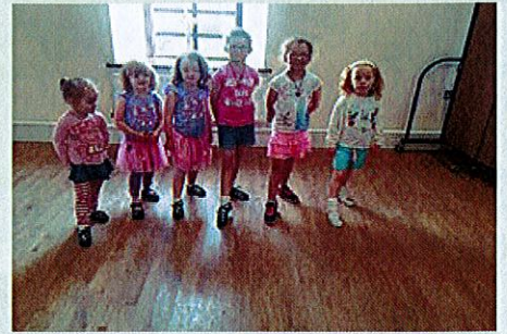
The girls of Clarke School of Irish Dance having fun at Summer Camp!

Activities in Omeath Youth Café were suspended in September this year due to the unfortunate event of a flood, however the youth café will be back up and running in the new year with a new focus ... !!