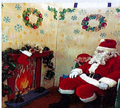
Ardaghy NS. hold their annual Santa Workshop in The Dolmen Centre. December 2016