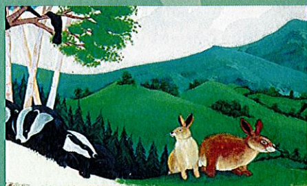
A beautiful mural depicting Irish Wildlife - painted in the local play park by the very talented Ray Hunt.